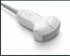
C5-1 ● 5-1 MHz Curved Scan Depth: 30 cm