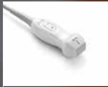
P5-1 5-1 MHz Phased Scan Depth: 35 cm

Arterial, Breast, Carotid, Musculoskeletal, Nerve, Superficial, Venous