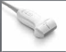
L12-3 ● 12-3 MHz Linear Scan Depth: 9 cm

Arterial, Lung, Musculoskeletal, Nerve, Ophthalmic, Superficial, Venous