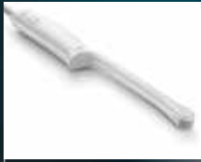
IC10-3 ● 10-3 MHz Curved Scan Depth: 15 cm

Abdomen, Gynecology, Lung, Nerve, Musculoskeletal, Early Obstetrics, Obstetrics, Spine