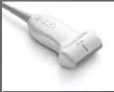
L15-4 ● 15-4 MHz Linear Scan Depth: 6 cm

Arterial, Breast, Carotid, Lung, Musculoskeletal, Nerve, Ophthalmic, Superficial, Venous