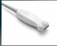
L19-5 ●● 19-5 MHz Linear Scan Depth: 6 cm

Gynecology, Early Obstetrics, Obstetrics